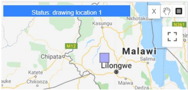
Figure 2: Draw tool interface

If the draw tool is selected, your mouse pointer should appear as a cross. If this does not appear, click the grey square icon on the top-right of Figure 2. To exit edit mode, press the X on-screen icon or ESC on your keyboard.