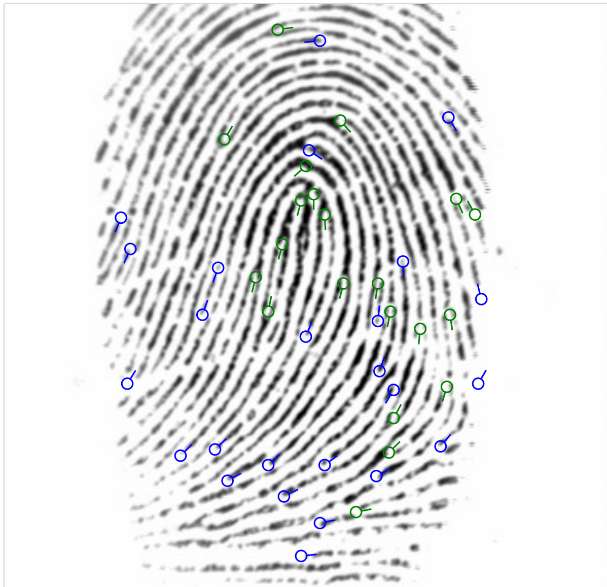
Minutiae found on the fingerprint image.

SourceAFIS algorithm is mostly about understanding fingerprints. Of course, SourceAFIS is not a human, so how could it understand anything? For algorithms, understanding data means describing it with high-level abstractions. In case of SourceAFIS, these high-level abstractions are minutiae , or ridge endings and bifurcations. Minutiae are simply points on the image with associated direction angle.